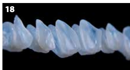
Fig. 18: Ultrathin veneers, often referred to as "contact lenses"