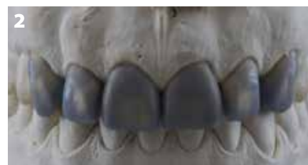
Fig. 2: Additive wax-up.