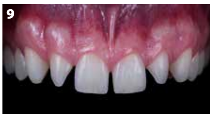
Fig. 9: Intraoral view after preparation.