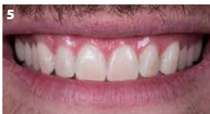
Fig. 5: Verifying the smile line.