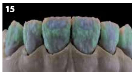
Fig. 15: Next enamel firing.