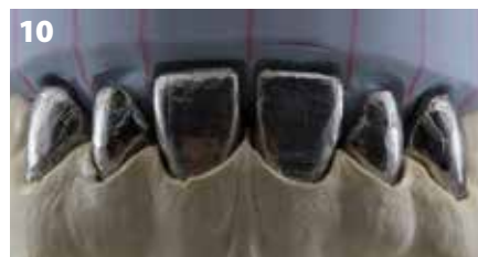
Fig. 10: The platinum foil adapted onto the alveolar model.