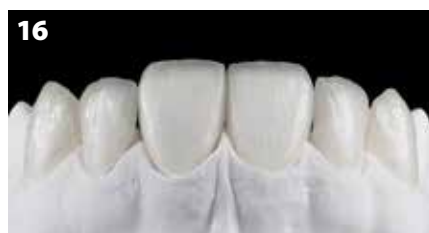
Fig. 16-17: The finished veneers on a work model.