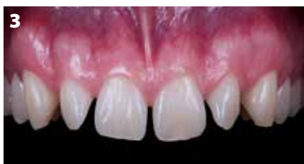
Fig. 3: Initial situation prior to preparation.