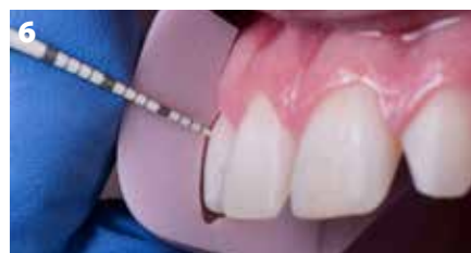
Fig. 6: Verification of the minimum preparation space with a preparation guide, based on the wax-up.