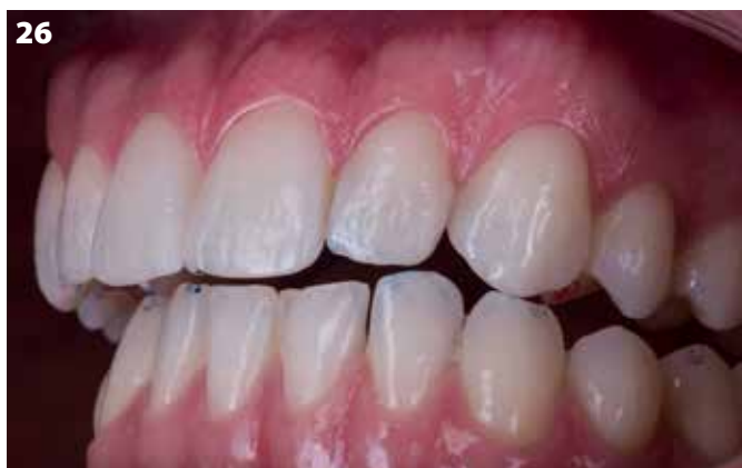
Fig. 20.21-22-23-24-25-26: Final view after veneer placement, as seen from different angles.