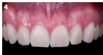
Fig. 4: Intraoral mock-up