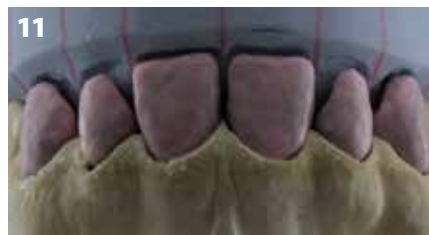
Fig. 11: First thin ceramic preparation layer

It is often assumed that the marginal adjustment of veneers made with the platinum foil technique is suboptimal. However, this reputation is not entirely justified; in many cases, this adaptation is even better than with a direct or injected veneer.