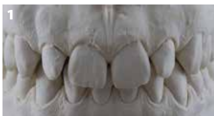
Fig. 1: Study model of the initial situation.

After the clinician has taken the impression, the alveolar work model can be prepared. The platinum foil has to be adapted to each die with the help of a Bunsen burner, taking special care and reheating the foil once it has been adapted to eliminate all possible remnants of grease.