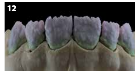
Fig. 12: Internal structure of dentine