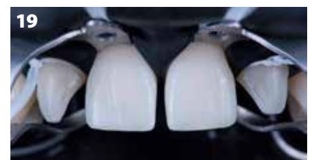
Fig. 19: Cementation under rubber dam