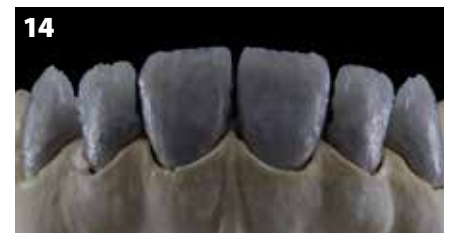
Fig. 14: Result after bake.